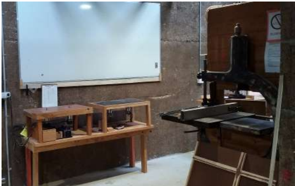
The Gifkins dovetail jigs new home.