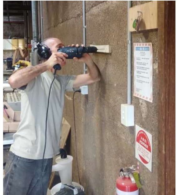
Getting everything loose off the floor.