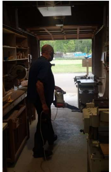
The dreaded leaf blower.