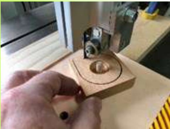
Band-sawing the perfect cylinder with a simple jig.