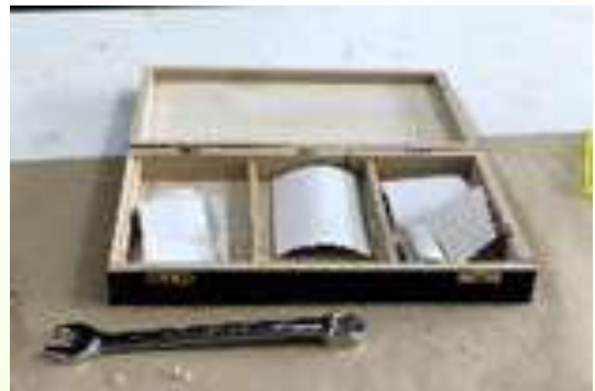
A sandpaper box