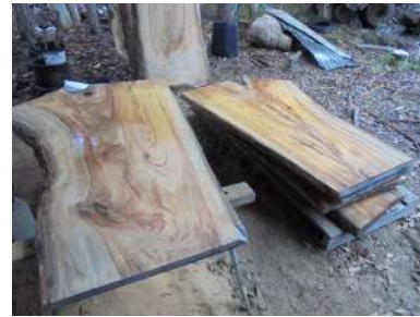
Some of the beautiful Camphor Laurel slabs