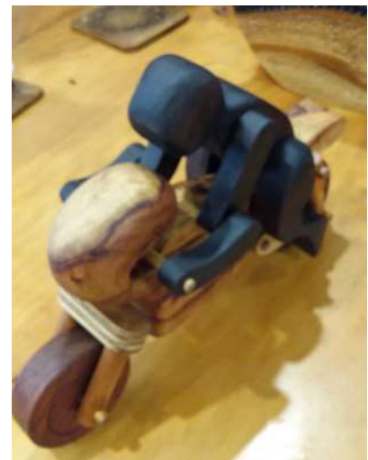
Alan Warner's motorbike, even the rider changes position